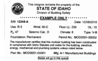
Example of Modular Insignia

Modular Building – Modular buildings - residential or commercial - are regulated by DBS; when approved they will bear an insignia from the state of Idaho. Work done at the place of manufacture is not subject to further regulation by local governments. However, work done at the site, including the installation, is regulated by the local government. Modular buildings are regulated by local planning and zoning ordinances the same as site built structures. Details of the DBS approval process are on the internet at http://dbs.idaho.gov/programs/modular/index.html