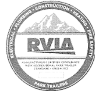
Example of Park Trailer Tag

The HUD manufactured home standard is intended for manufacturing facilities and is very difficult to apply to one time construction.